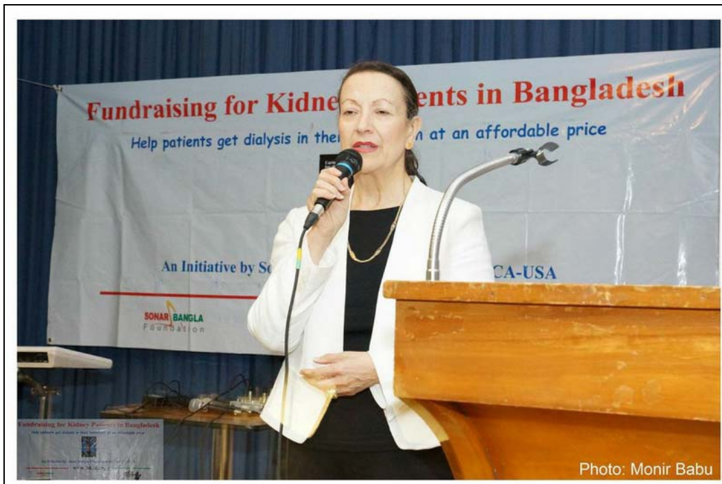
Picture 10: Ms. Maria Minna, former MP and federal Minister of Canada, Minister for CIDA, with her morale support for the initiative